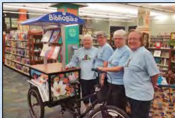
The BiblioBike is made possible by the Friends of the Lafayette Public Library.

For more information about the BiblioBike or other library services, please visit lafayettepubliclibrary.org .