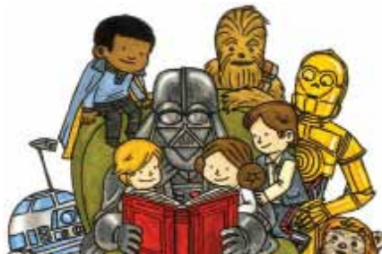
Darth Vader and Friends

Calling all Jedi! Drop by for fun activities, photo ops, snacks and Star Wars-themed crafts.