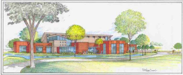
Proposed: South Regional Branch Lafayette Public Library

The Sellers Group Architecture-Engineering Interiors