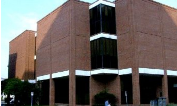
Opened in 1973