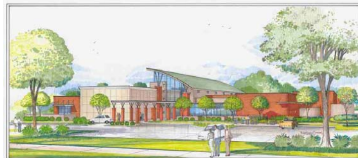
Proposed: South Regional Branch Lafayette Public Library

The Sellers Group Architecture-Engineering Interiors